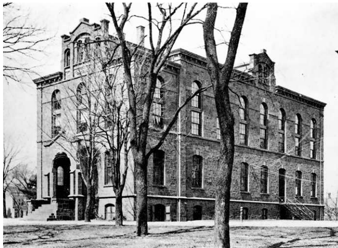
Figure 10 Geology Hall