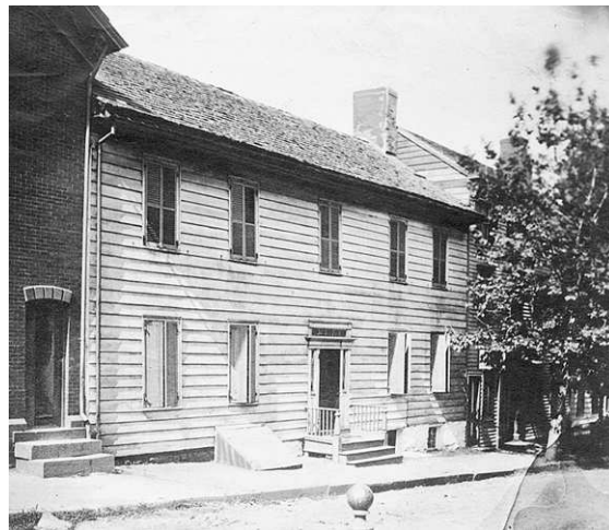
Figure 3 Old College Hall