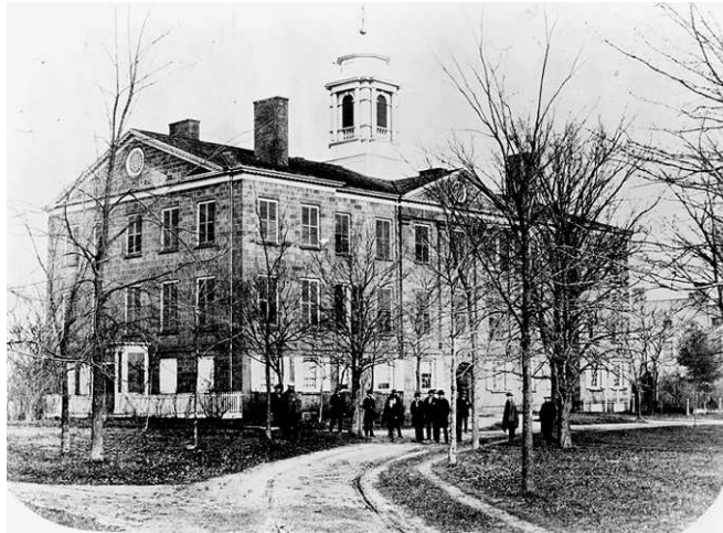
Figure 4 Old Queen's Building

Old Queen's, still stands, and is a focal point of the University, housing the office of the President. 19